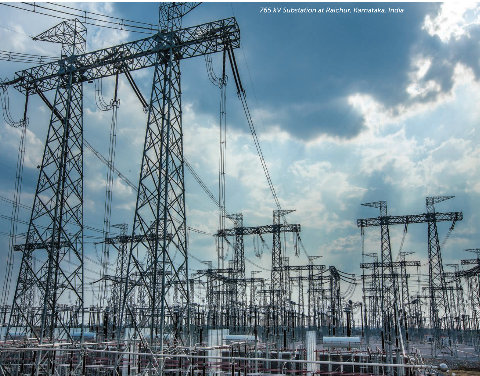
765 kV Substation at Raichur, Karnataka, India

Company has steadily expanded its product portfolio through both partnerships with global OEMs as well as in-house product development. The in-house product development is backed by consistent investment of more than 2.5% of revenue on R&D and innovation. At BHEL, we firmly believe that serving our customers, protecting the environment, and contributing to society are intrinsically linked, and form the core of our corporate ethos. The Company has been supporting communities through programs like skill development; promoting health, hygiene & education; and running several programs on environmental protection & improvement.