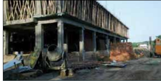
Tribal Welfare School under construction

Taking into consideration the holistic development of communities through intervention of setting up tribal schools in remote parts of North-Eastern States, BHEL undertook a project "Construction of Tribal Welfare School" at Bhubaneswar Nagar in Assam. The ultimate goal is to educate tribal, rural and slum children such that they grow with a self esteem to take the right decisions in life. The project also aims at developing the interest of the students in studies and to augment their artistic skills.