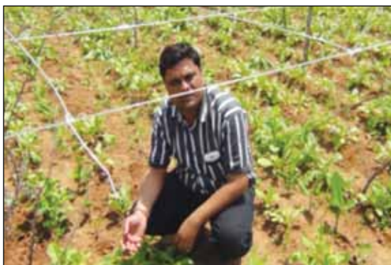
Field visit to the farms for assessing the quality of soil in the Region

such as nursery management, crop management, training and awareness program for agriculture techniques, pest management and post harvest efforts are being undertaken to encourage them to adopt advanced technology in carrying out their agricultural work resulting in production of high quality vegetable crops and earn a reasonable income for themselves. Also, enhancement of quality of existing crops including vegetable crops is being emphasized upon under the project. The project aims at empowering the tribal farmers to pursue better agricultural practices/ farming on a sustainable basis.