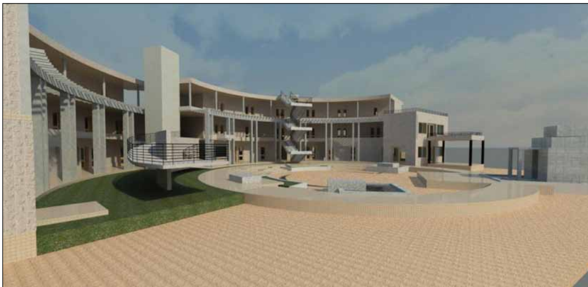
Graphical representation of Ganga Prem Hospice

In the West, terminally-ill patients choose to die at home, with excellent end-of-life medical care facilities. In India, patients are forced to die at home, in absence of hospice or any kind of palliative care. For a country with ten lakh new cancer cases every year, 70% of which are already in non-curable stages by the time the cancer is diagnosed, India's hospice facilities are still woefully short.