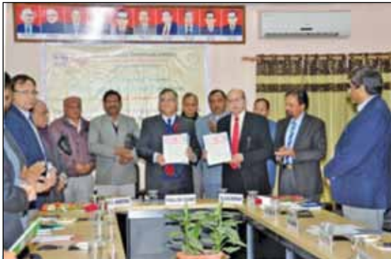
Signing of MoU between BHEL & Shraddha Cancer Care Trust at Haridwar.

Entering into its Golden Jubilee year (the 50th year of its establishment), BHEL has undertaken yet again a very noble CSR initiative to alleviate the suffering and pain of terminally ill cancer patients who are battling with this deadly disease. As part of its Golden jubilee CSR initiatives, the Company has provided financial support of Rs. 2.43 Crore to Shraddha Cancer Care Trust, Haridwar towards construction of a 30-bed Hospice for providing palliative cancer care to terminally ill cancer patients through medical, social, emotional and spiritual support to the patients and their families.