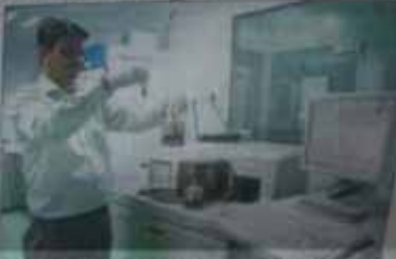
The new centre is equipped to test blood samples for various like B19 and Hepatitis B and C.

Wagha Puri wagha@bhel.com It is a bid to help children suffering from thalassaemia, a life-threatening blood disorder, in collaboration with the Thalassemia Foundation and the Thalassemia Foundation.