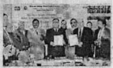
भेल ने कैंसर पीड़ितों की मदद के लिए 15 करोड़ रुपये का योगदान दिया है।

भेल की देवरेख में कैंसर के पीड़ितों की मदद के लिए भेल ने 15 करोड़ रुपये का योगदान दिया है।