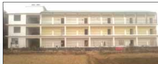
Tribal Welfare School, Bhubaneswar Nagar, Assam

The project involved construction of a Kuchha school to be transformed into a Pukka construction within a plinth area of 14700 square feet. The area – Bhubaneswar Nagar has been lacking proper educational and community facilities. Construction of a Pukka school for children ensures that the children are well groomed and equipped with better skills. The school also takes care of the clothing, food, books and transport for the children. The construction of the school is complete and it was inaugurated in April, 2013.