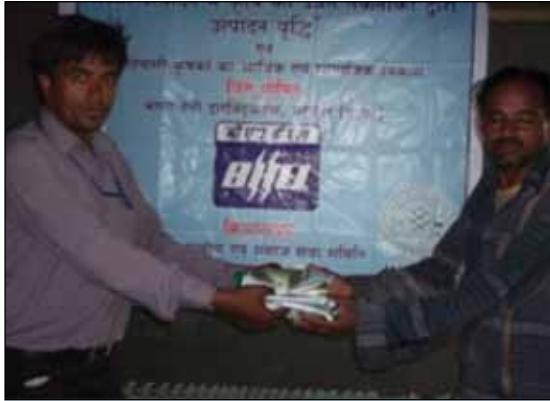
Seeds are being distributed to a farmer

such as nursery management, crop management, training and awareness program for agriculture techniques, pest management and post harvest efforts are being undertaken to encourage them to adopt advanced technology in carrying out their agricultural work resulting in production of high quality vegetable crops and earn a reasonable income for themselves. Also, enhancement of quality of existing crops including vegetable crops is being emphasized upon under the project. The project aims at empowering the tribal farmers to pursue better agricultural practices/ farming on a sustainable basis.