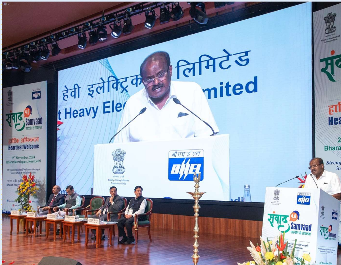
Hon'ble Union Minister of Heavy Industries and Steel, Shri H. D. Kumaraswamy inaugurating BHEL SAMVAAD 4.0