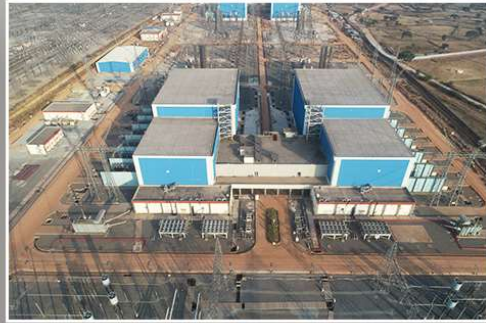
\pm 800 kV, 6,000 MW Raigarh – Pugalur UHVDC link