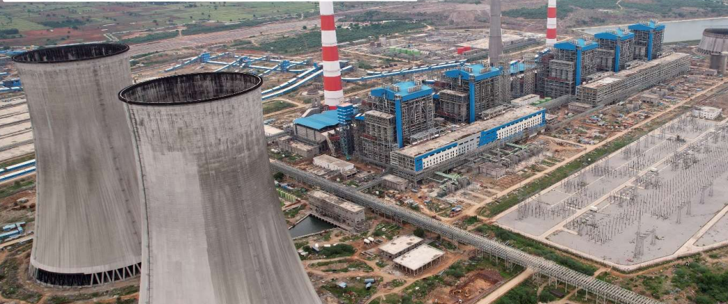
Hon'ble Chief Minister of Telangana inaugurating 800 MW Unit#2 of Yadadri Thermal Power Station