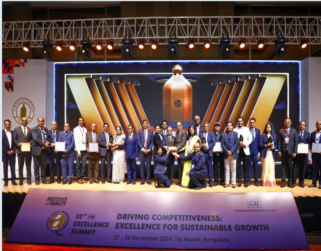
CII EXIM Bank Award for Business Excellence 2024